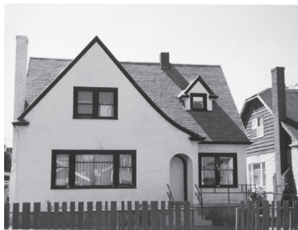
The Rayburn Home 1979

FROM THE TACOMA NEWS TRIBUNE, JUNE 3, 1978