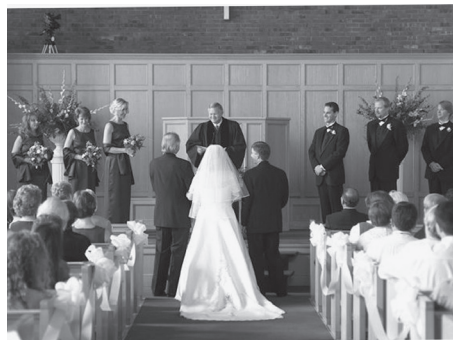
August 31, 2002